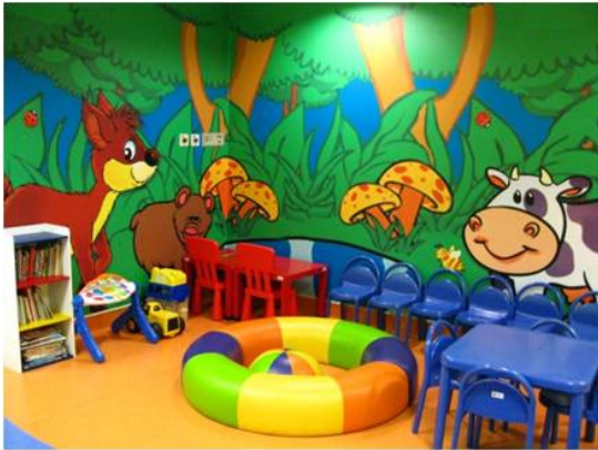
CCF @ NUH