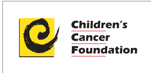
FULL-COLOUR VERSION – PREFERRED