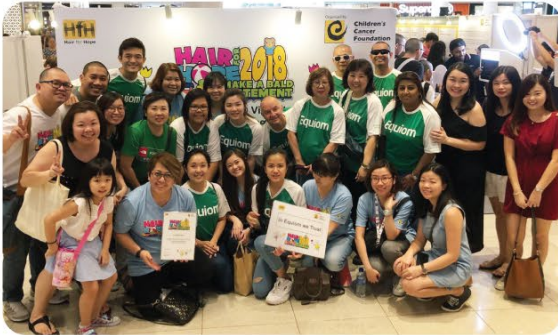
In Equiom we Trust