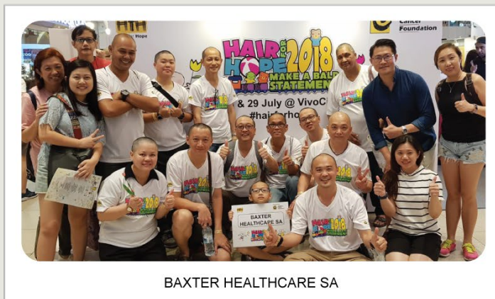
BAXTER HEALTHCARE SA