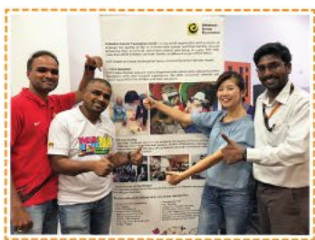
Orange Business Services Singapore Pte. Ltd