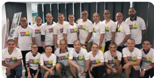
Civil Aviation Authority of Singapore