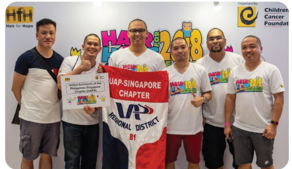
United Architects of the Philippines Singapore Chapter (UAPS)