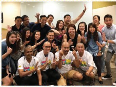
Sentosa Development Corporation