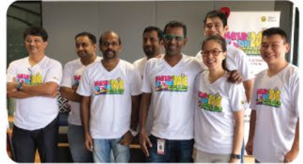
Red Hat Asia Pacific Pte Ltd