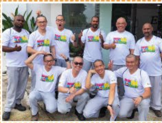
PON Asia Holding Pte. Ltd