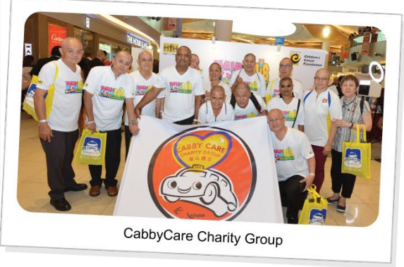
CabbyCare Charity Group