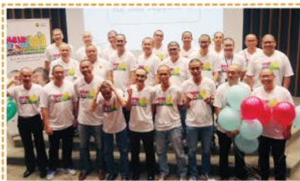
Defence Science and Technology Agency