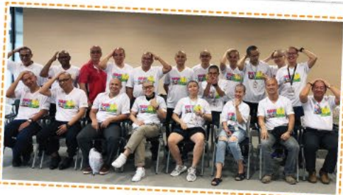
Building and Construction Authority