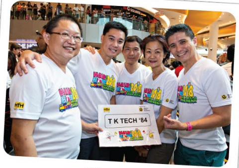
T K TECH '84