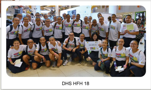
DHS HFH 18