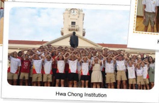
Hwa Chong Institution