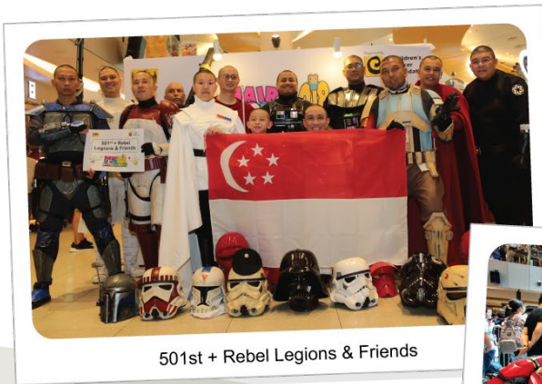
501st + Rebel Legions & Friends

Among the HfH 2018 groups, were long-standing supporters including representatives from Credit Suisse AG and three-time HfH participant Botak United. The groups also comprised students and alumni hailing from educational institutions like Catholic High School, Dunman High School and Tanjong Katong Technical Secondary School.