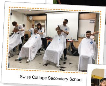
Swiss Cottage Secondary School