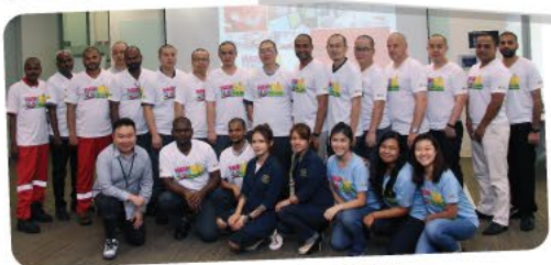
Halliburton Far East Pte Ltd