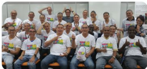
Thermo Fisher Scientific