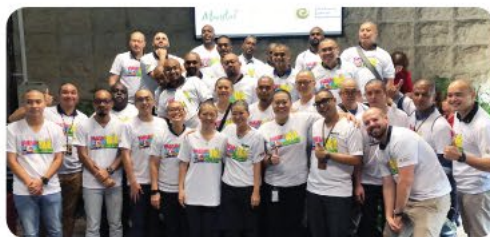
Wildlife Reserves Singapore Pte Ltd