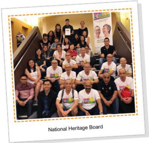
National Heritage Board