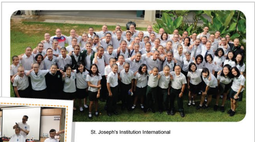
St. Joseph's Institution International