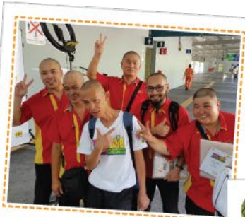
Go Ahead Loyang Pte. Ltd