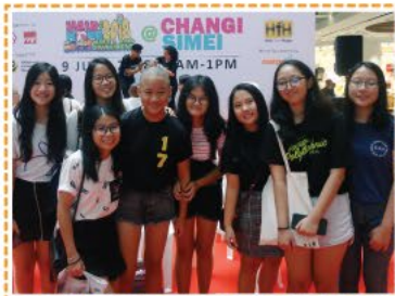
Changi Simei Citizens' Consultative Committee