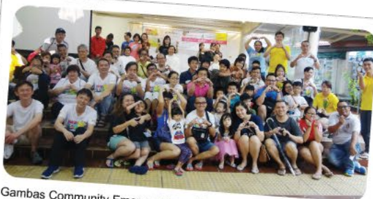
Gambas Community Emergency and Engagement Committee (C2E)