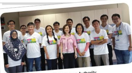
Health Sciences Authority