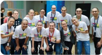
AbbVie Operations Singapore Pte Ltd

KMSPKS has, once again, emerged as among the top satellite event fundraisers for HfH 2018. In the past six years, KMSPKS has raised over a million dollars, in aid of children with cancer and their families.