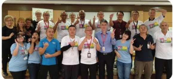
Singapore Technologies Kinetics Ltd