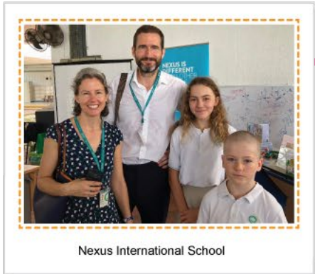
Nexus International School