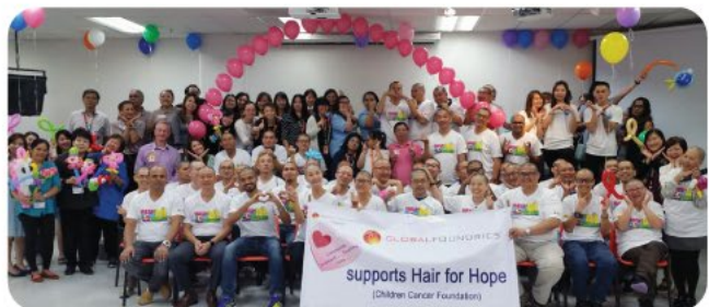
GLOBALFOUNDRIES Singapore Pte Ltd