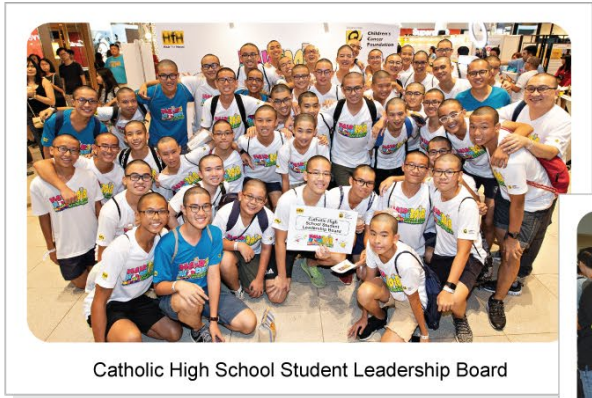
Catholic High School Student Leadership Board