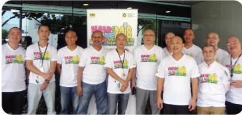
Rockwell Collins Southeast Asia Pte Ltd