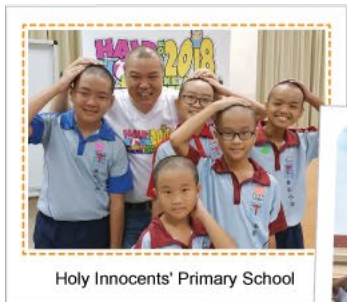
Holy Innocents' Primary School