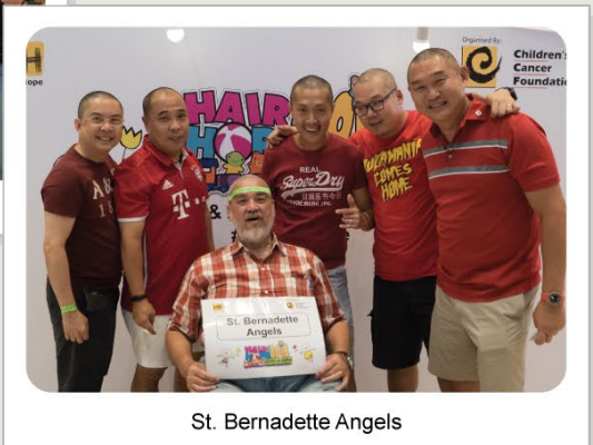
St. Bernadette Angels