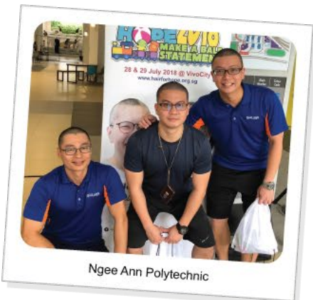
Ngee Ann Polytechnic