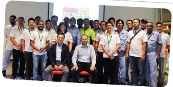
Senoko Energy Pte Ltd