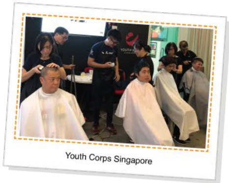
Youth Corps Singapore