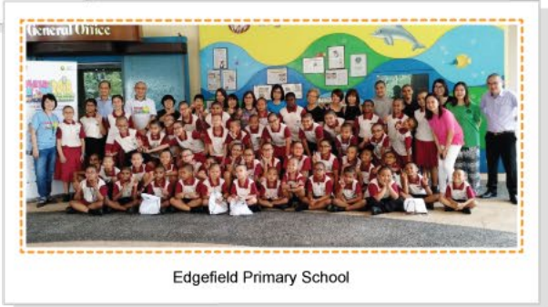
Edgefield Primary School