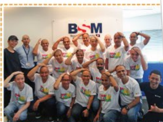
Bernard Schulte Shipmanagement (Singapore) Pte Ltd