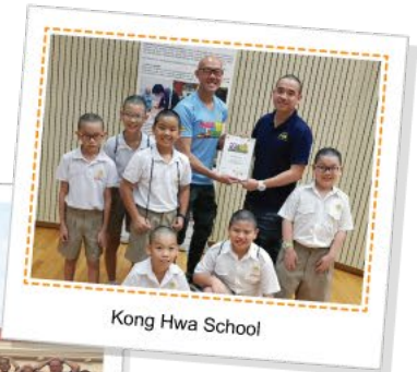
Kong Hwa School