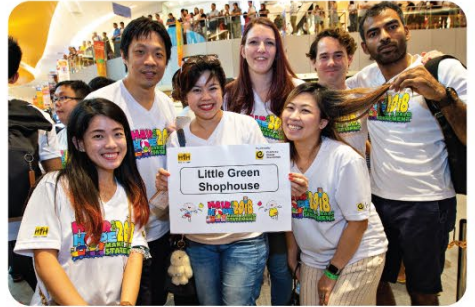
Little Green Shophouse