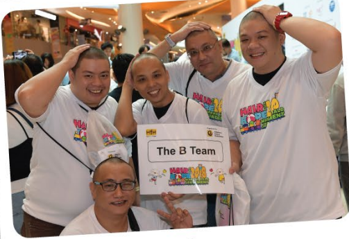
The B Team