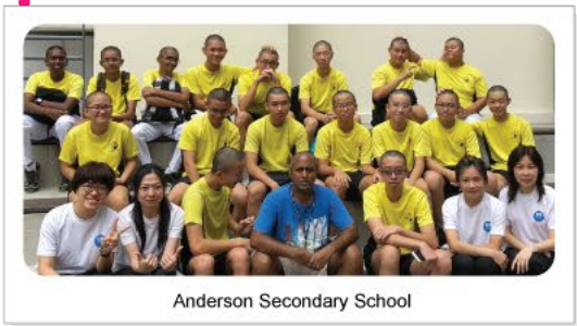
Anderson Secondary School