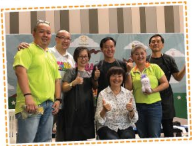
Sunflower Childcare Group Pte Ltd