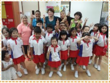
PCF Sparkletots Preschool @ Ang Mo Kio - Hougang Blk 929