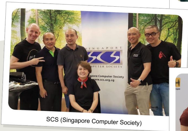
SCS (Singapore Computer Society)