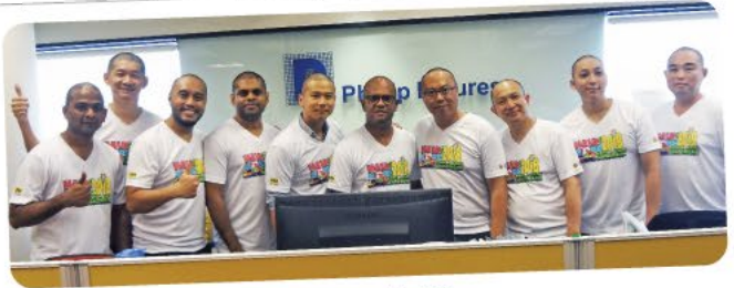
Phillip Futures Pte Ltd