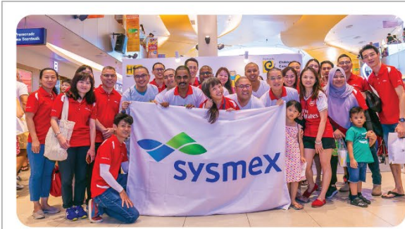
Sysmex Gives Back