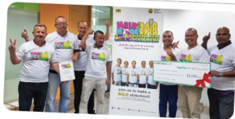
Arcadis Singapore Pte Ltd