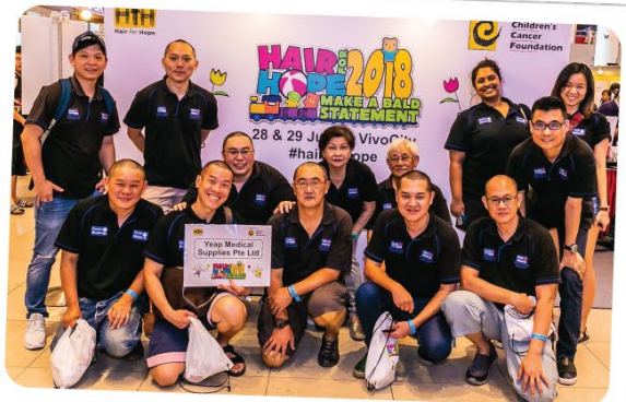
Yeap Medical Supplies Pte Ltd