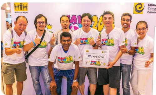
We Are One