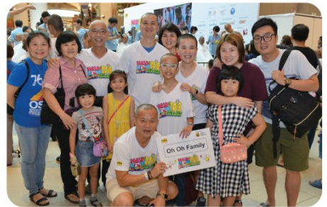
Oh Oh family