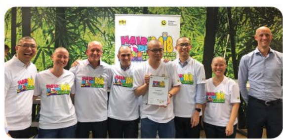
Hapag-Lloyd Pte Ltd