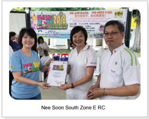
Nee Soon South Zone E RC