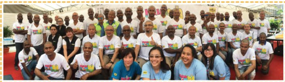
Kajima Overseas Asia (Singapore) Pte Ltd