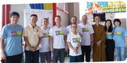
Kong Meng San Phor Kark See Monastery