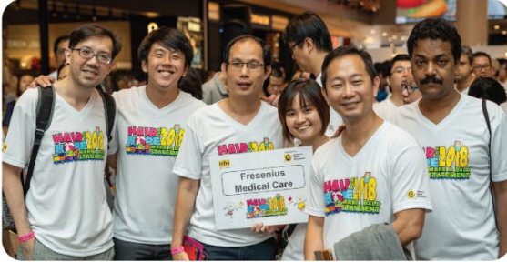
Fresenius Medical Care