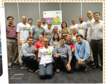
Deutsche Bank AG