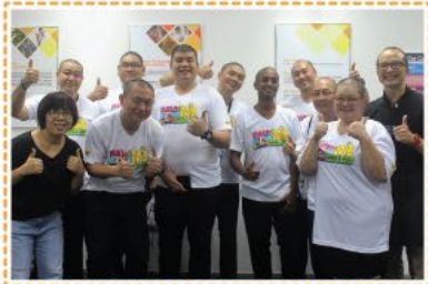
ST Electronics (Info-Comm Systems) Pte Ltd