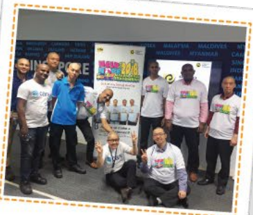
Kuehne + Nagel Pte Ltd