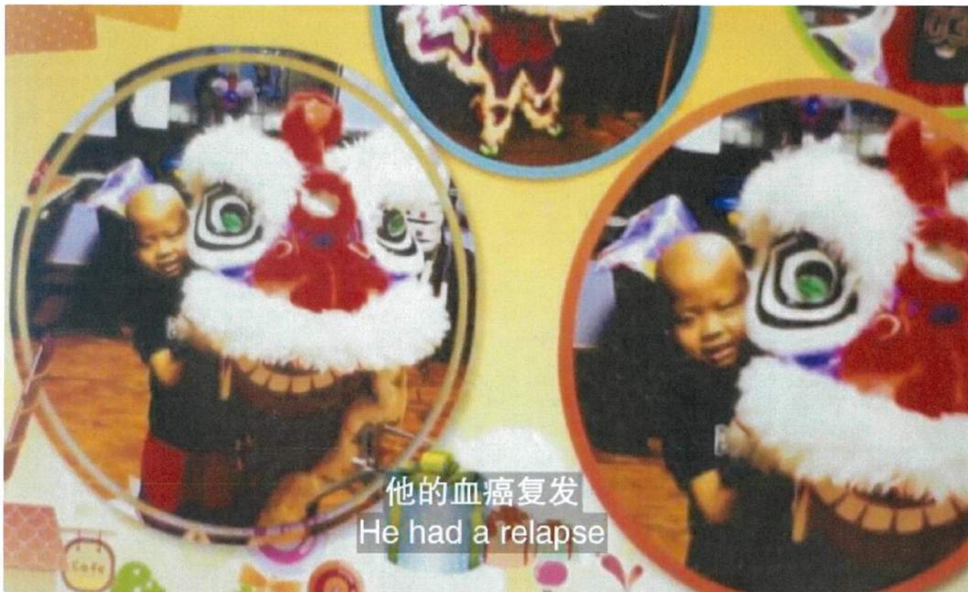
Photo: Video screengrab